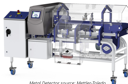
Metal Detector source: Mettler-Toledo

The local partner of choice for sustainable conveyor belting solutions - around the globe.